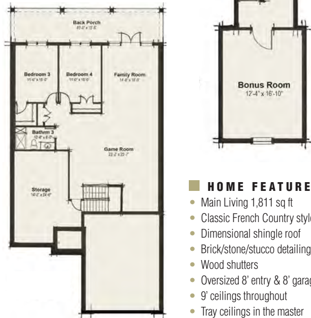
TERRACE LEVEL 1,522 SQ. FT.