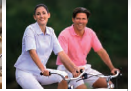
THE RHINE I