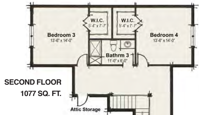
SECOND FLOOR 1077 SQ. FT.