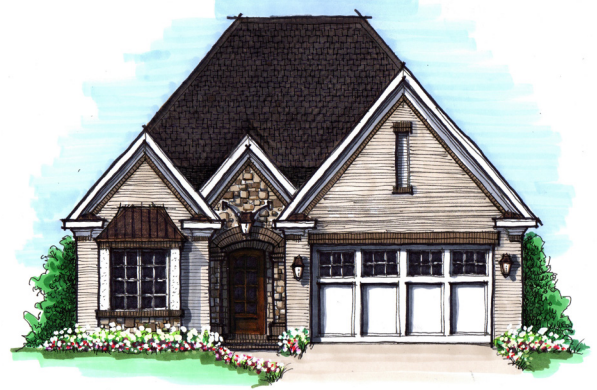
The Loire homeplan facade rendering from the Bay Collection of home designs.